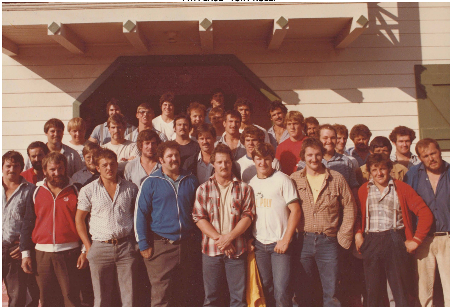
34+ SCHWINGERS WITH CUTS AFTER THE 4TH ROUND