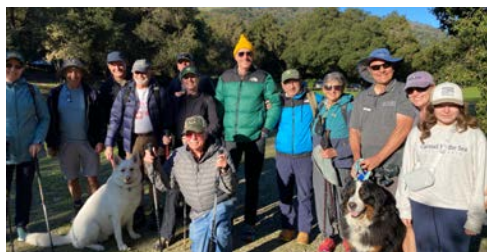
Photo from our recent club hike in Sunol. Please join us for the next one coming up in June!