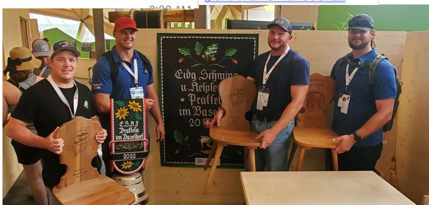
Prizes selected by our Schwingers at the 2022 Pratteln im Baselbeit Eidg.