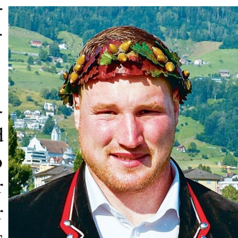
2022 Eidg König Joel Wicki