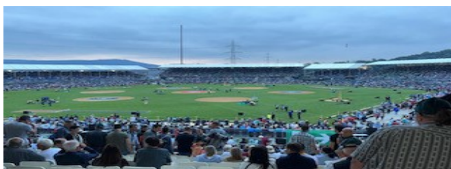
Left: Vantage Point where they watched the guys wrestle