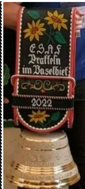
Grant Widmer's Bell