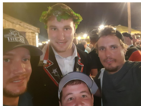
Who wouldn't want a selfie with König Wicki at the after parties !