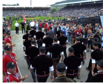
@esaf2022 on instagram: https://www.instag ram.com/p/Ch9QB zqqd02/?hl=en